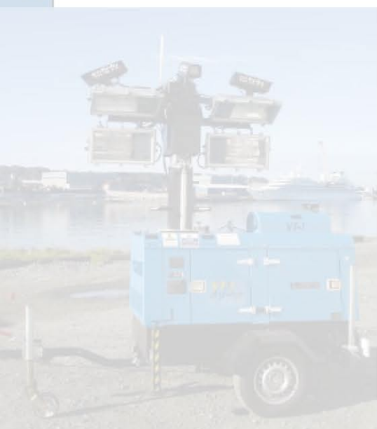
Towerlight's VT-1 lighting tower. The company also now sells pumps.

On-site equipment includes rental perennials such as generators, compressors and lighting towers. A major player in this sector, of course, is Atlas Copco, which will display its newly designed, portable QAS 125-150 mid-range generators and XA S 296-446 mid-range compressors. Also moving air is CompAir. It has given the TurboScrew range new, electronic control systems and Cummins Stage III-compliant engines. Last, but not least, of compressor mentions is Kaeser of Germany. The Mobilair 100 model, powered